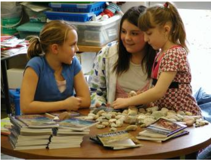
Students examining Michigan rocks at Wilcox Elementary School in Holt with their new books.